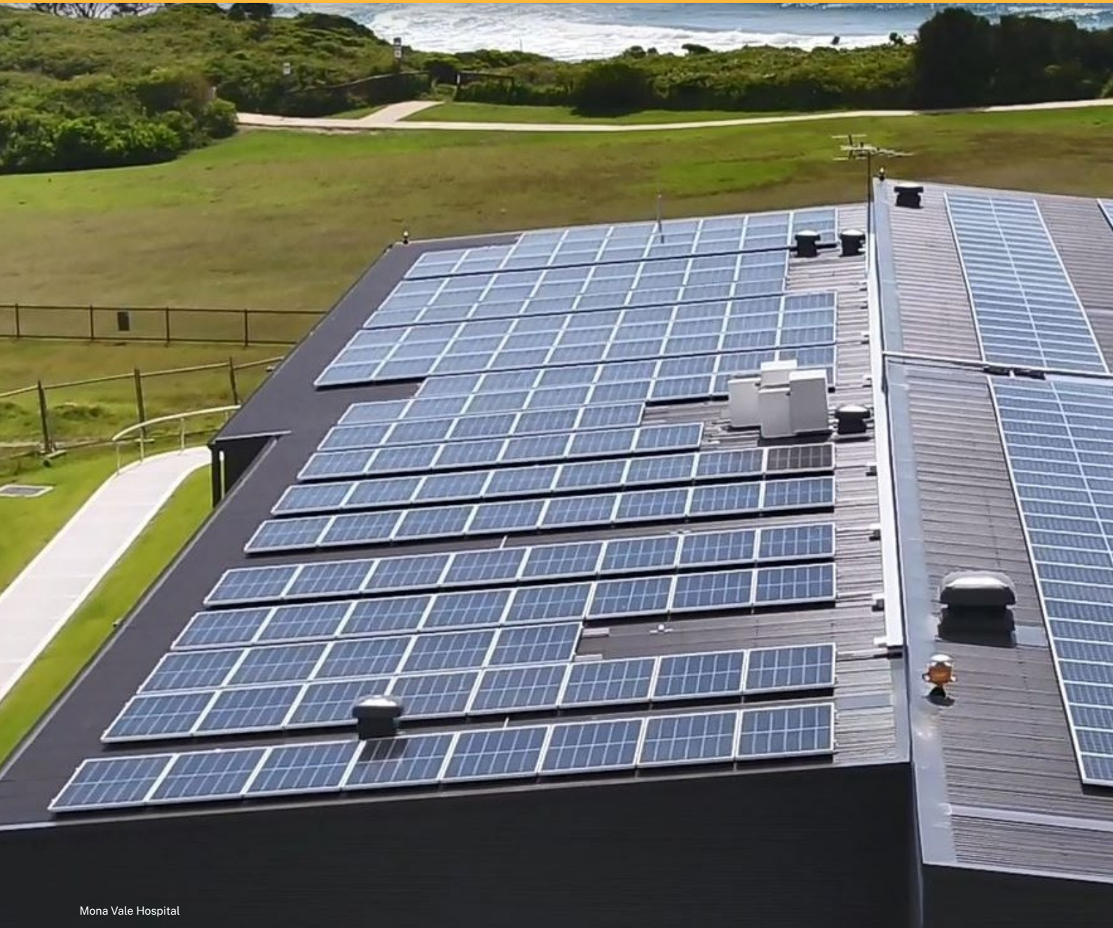
Mona Vale Hospital